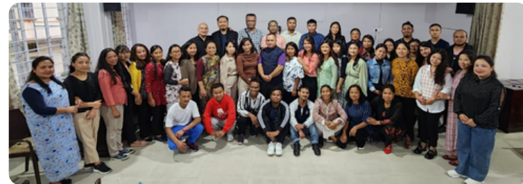
Rapid Assessment Survey at Mawiong