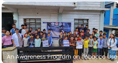
An Awareness Program on Tobacco Use