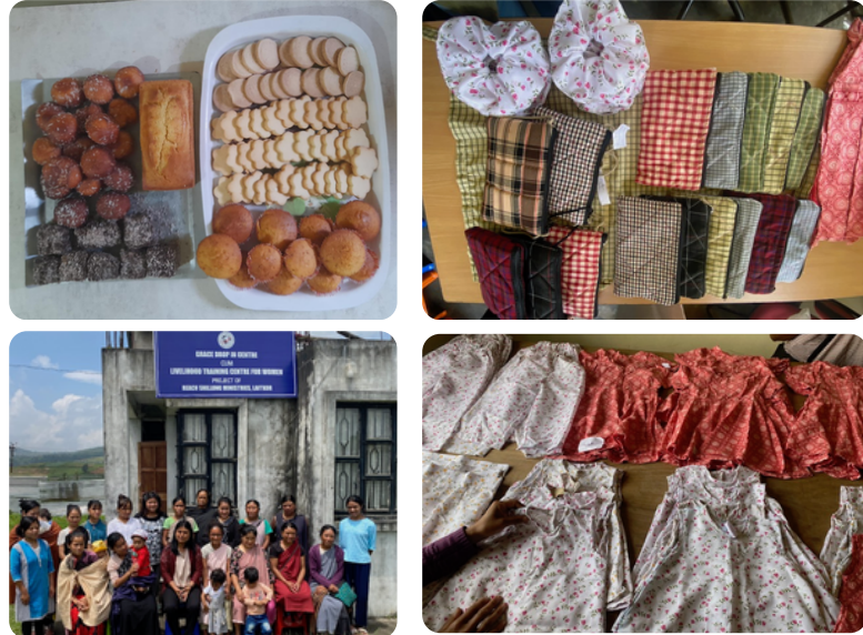
Products from Grace Drop In Centre for Women