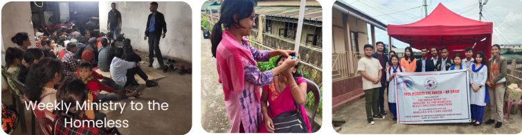
Weekly Ministry to the Homeless