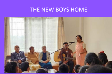
THE NEW BOYS HOME