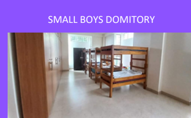
SMALL BOYS DOMITORY