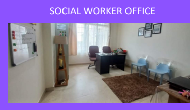
SOCIAL WORKER OFFICE