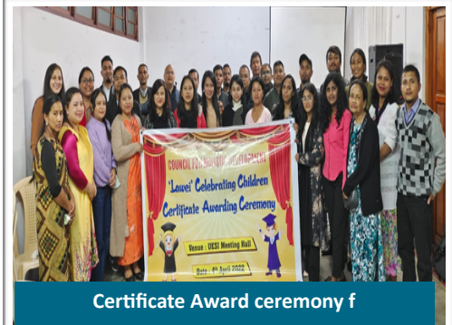
Certificate Award ceremony f