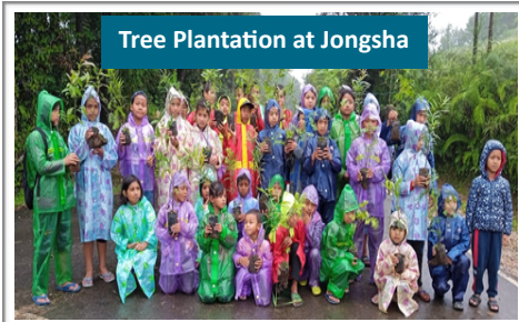
Tree Plantation at Jongsha