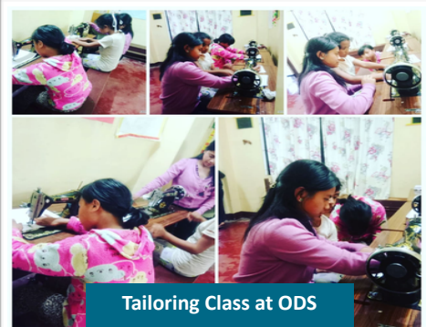
Tailoring Class at ODS