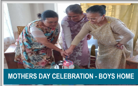
MOTHERS DAY CELEBRATION - BOYS HOME