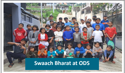
Swachh Bharat at ODS