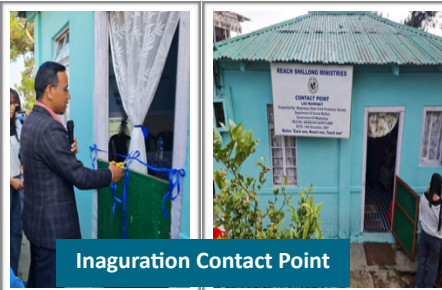
Inaguration Contact Point