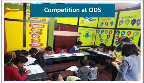
Competition at ODS