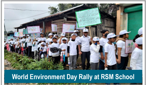
World Environment Day Rally at RSM School