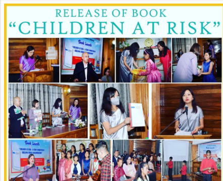
RELEASE OF BOOK "CHILDREN AT RISK"