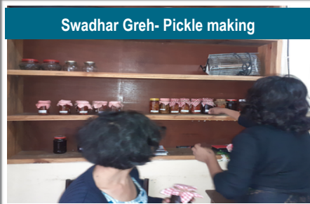
Swadhar Greh- Pickle making