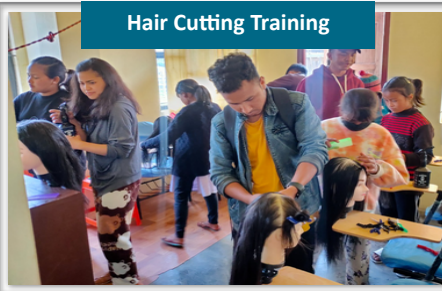
Hair Cutting Training